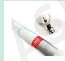
Reci Tube 100W T4