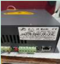
Hy 100w Power supply