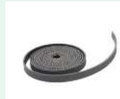
Speed guide imported belt