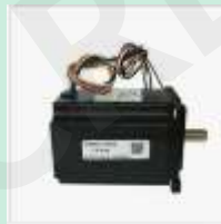
Lead shine moter stepper