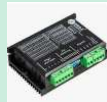
Lead shine drive stepper