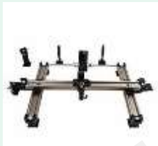
Speed guide Taiwan