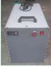
Colling chilar(New design)