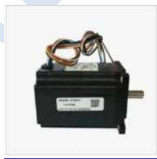
Lead shine moter stepper