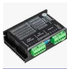
Lead shine drive stepper