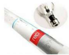
Reci Tube 100W T4