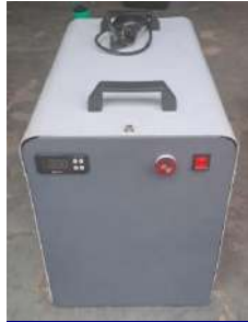
Colling chilar(New design)