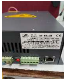
Hy 100w Power supply