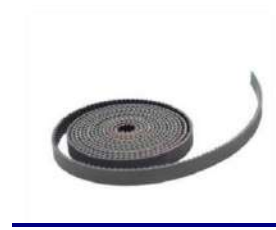
Speed guide imported belt