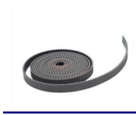
Speed guide imported belt