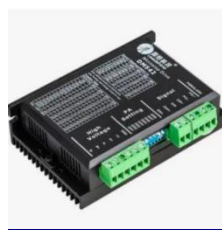
Lead shine drive stepper