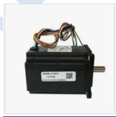
Lead shine moter stepper