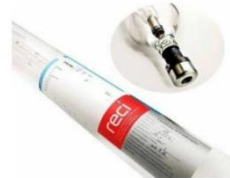
Reci Tube 100W T4