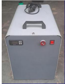
Colling chilar(New design)