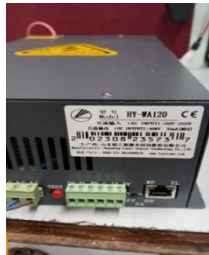
Hy 100w Power supply